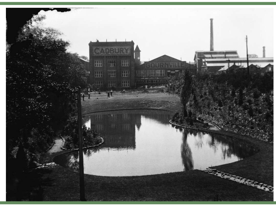
This session is designed to meet elements of the National History Curriculum including KS3- a Local history study.